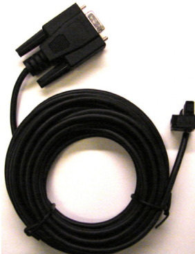
LPPK Cable for use with LPPK Program