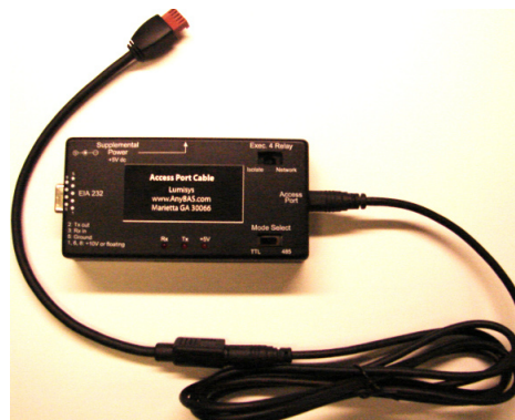
Access Port Cable for use with AppLoader Program