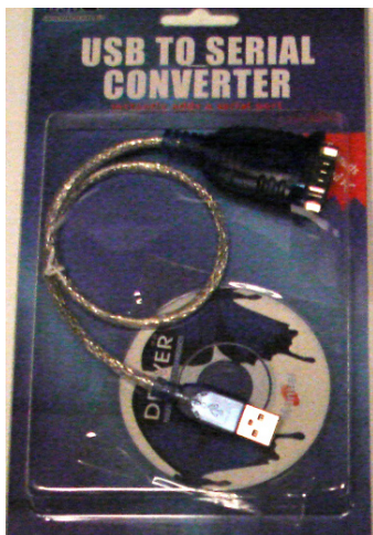
USB to 232 cable and disk for use with Access Port Cable